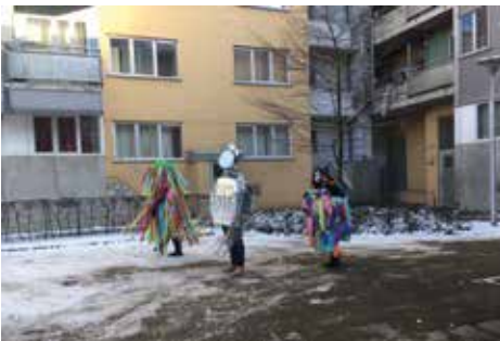
Research Week in collaboration with Faculty of Design Sciences - UAntwerp. IDW Antwerp