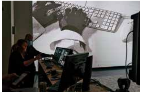
Research day 'VISI.ON.AIR. Talks and thoughts about media, art and technology', by MAXlab.