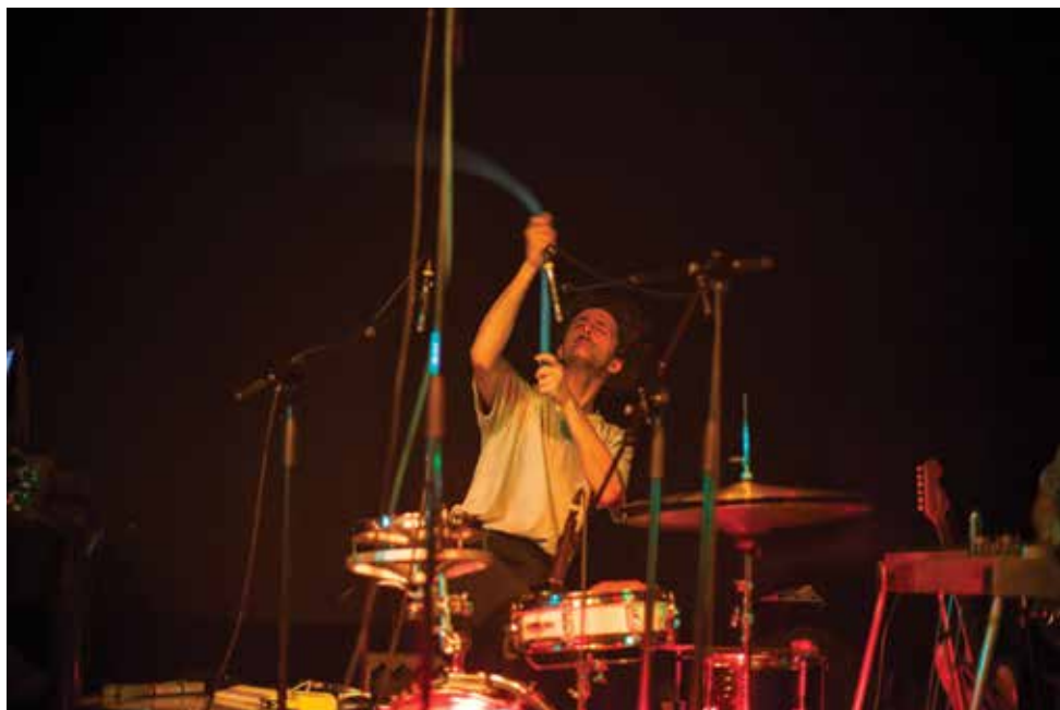
Release Track Report LP 'Singer Featherweight' by LEAP/DETACH.