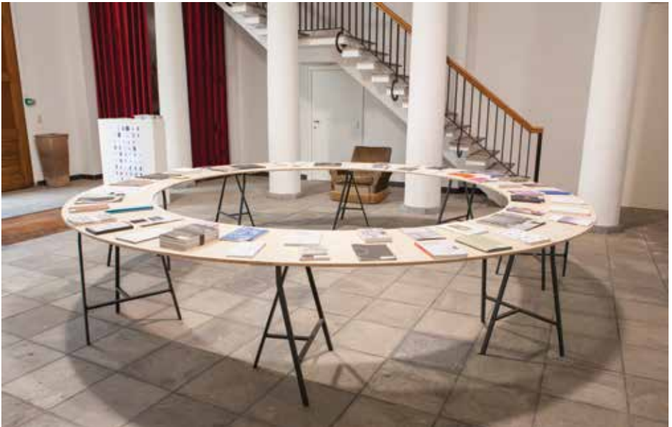
Track Report publications

You can consult (or buy) all the Track Reports in our Library. More info on https://www.ap-arts.be/en/track-report-eng