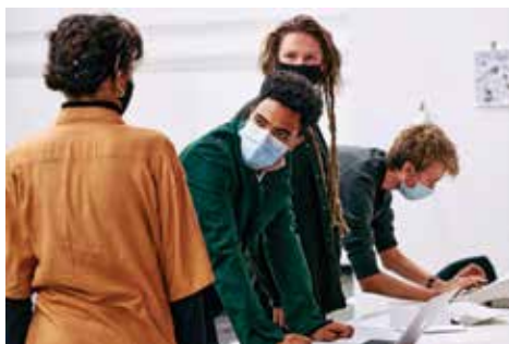
Research week, masterclass ‘The world looks indeed quite different’, by Els Dietvorst.

The installation will be used to display new publications on actual topics – it’s an easy way to get an overview of what is going on in the research at the academy.