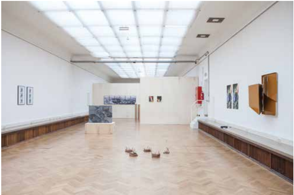
The exhibition 'The Unruly Apparatus' presented the end result of a six-month research project at the Royal Academy of Fine Arts Antwerp

FOLLOW US FB artandresearchantwerp IG soon!