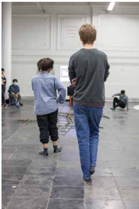
Research Week, masterclass ‘The world looks indeed quite different’, by Els Dietvorst.