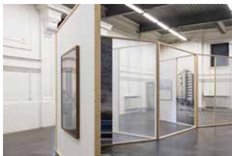
Presentation 'Photo/Space', by researcher Pieter Huybrechts