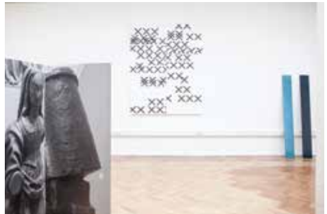
The exhibition 'The Unruly Apparatus' presented the end result of a six-month research project at the Royal Academy of Fine Arts Antwerp