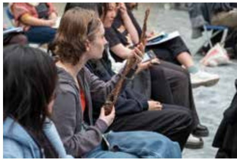
METHOD/ART, ARIA Research Seminar