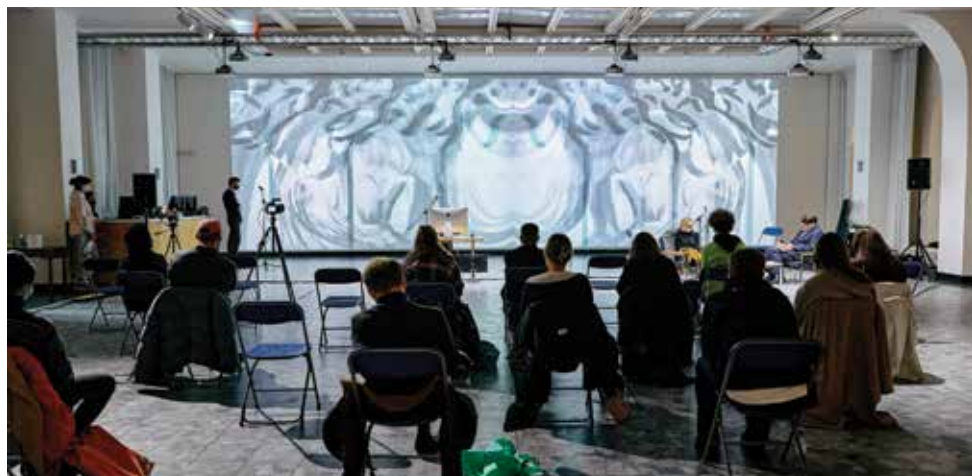
Research day 'VISI.ON.AIR. Talks and thoughts about media, art and technology', by MAXlab.

See full program, descriptions of the research classes and information on registration: https://www.ap-arts.be/en/research-week-october-2021