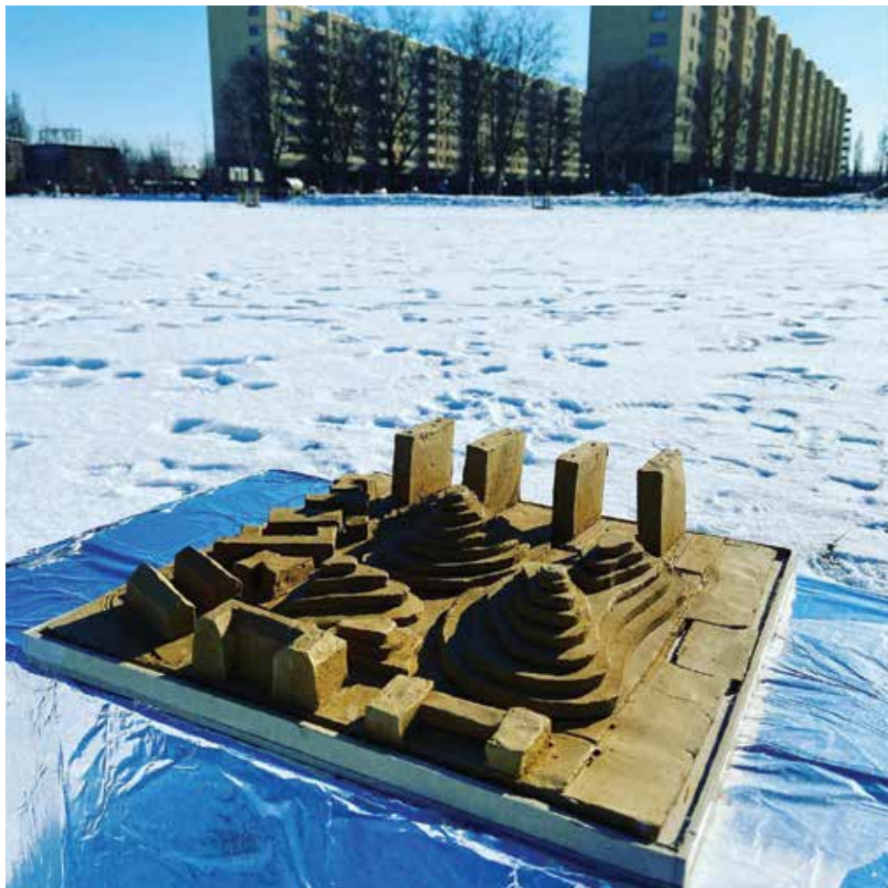
Research Week in collaboration with Faculty of Design Sciences - UAntwerp. IDW Antwerp